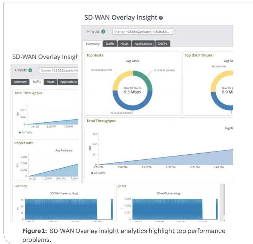
Figure 1: SD-WAN Overlay insight analytics highlight top performance problems.

Senior Engineer, Securities Trading Company