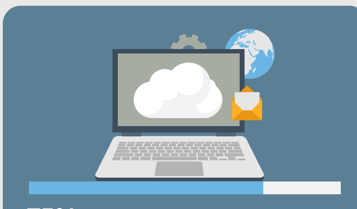
75% of Middle East companies agree that cloud is 'important' to their organisation's network strategy