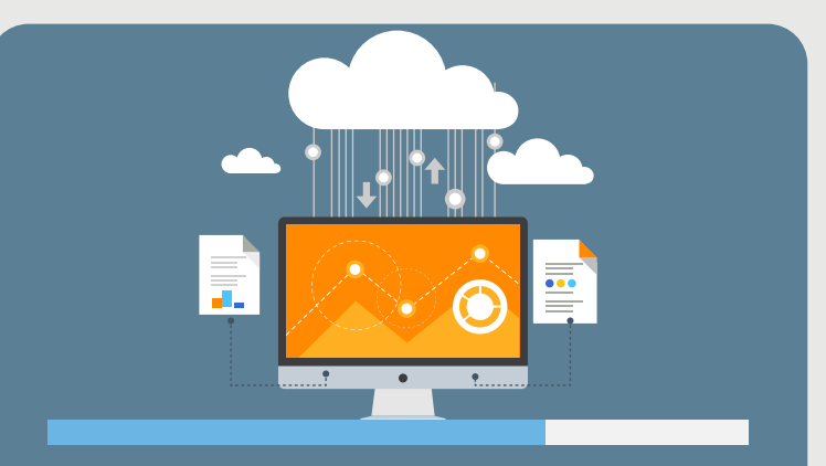
71% believe cloud is crucial to their digital transformation