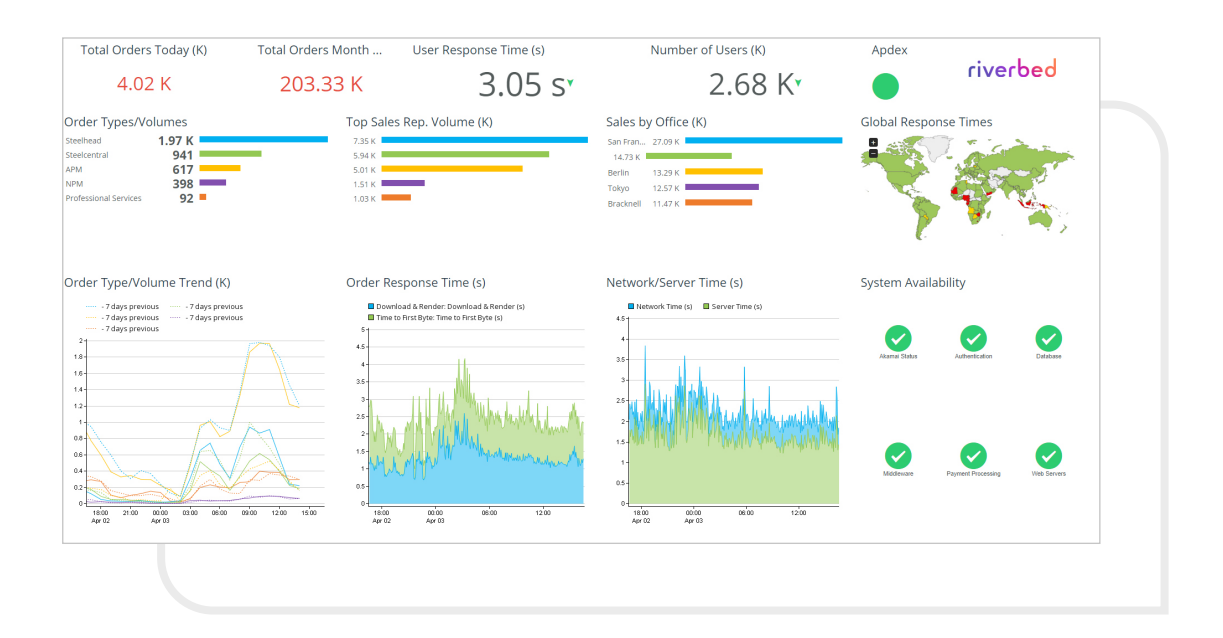
Figure 1: Riverbed Portal lets you bring together different types of network, application, and end user data for a holistic understanding of your IT environment.

Riverbed Portal also makes it easier to communicate application status and performance, as well as show SLAs in a way that non-IT stakeholders can understand. Portal gives you a central way to regularly communicate the value IT is bringing to the enterprise, instead of executives only hearing from IT when there is a problem.