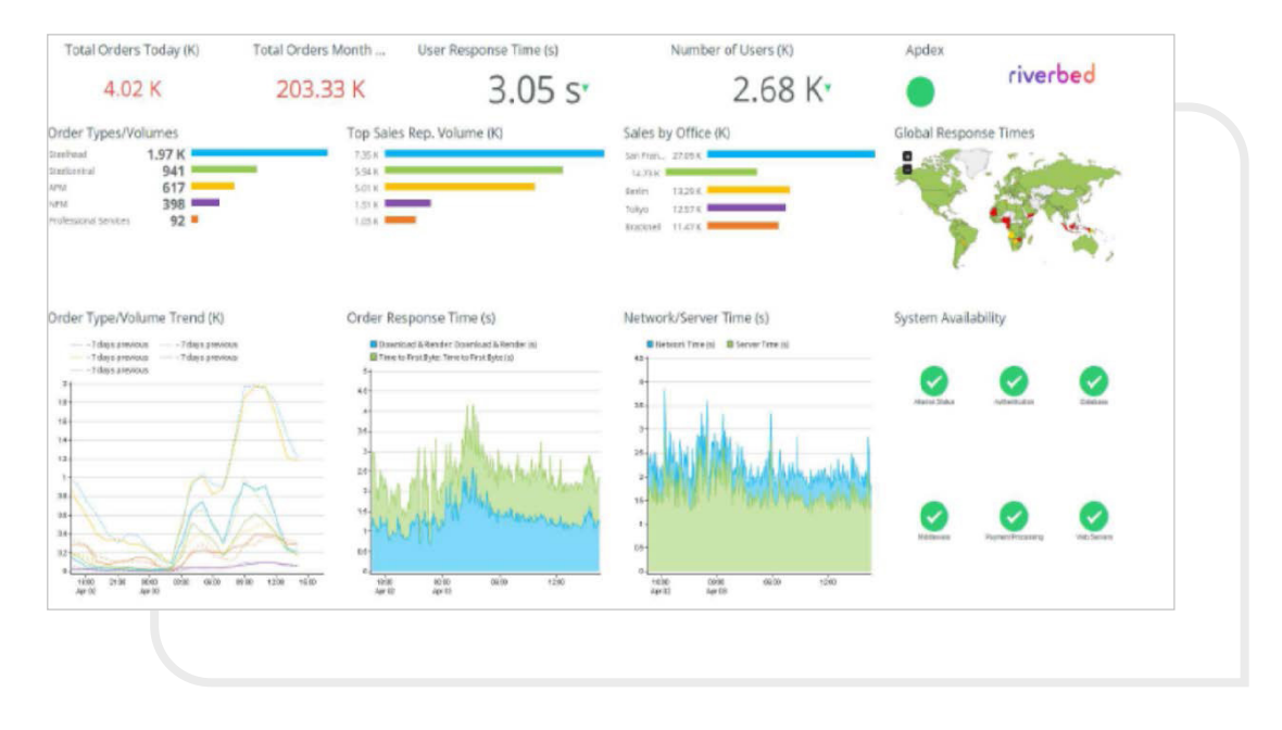
Figure 2: Unified Observability provides actionable insights to deliver personalized experiences.

Riverbed provides the Unified Observability platform banks need to optimize their infrastructure by capturing high fidelity, full-stack data on every transaction across the entire digital ecosystem – driving superior customer experiences while improving retention and business outcomes.