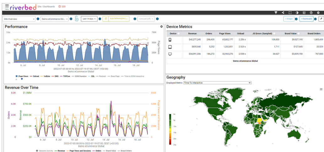
Figure 2: Riverbed enables you to associate user journeys and performance to revenue, conversion rate and abandonment rate to increase engagement and optimize business results.